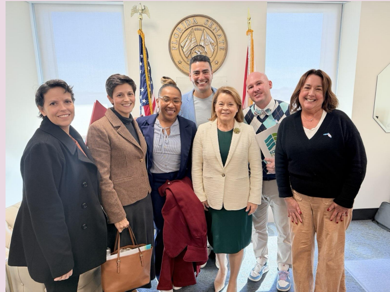
PFLAG in Tallahassee