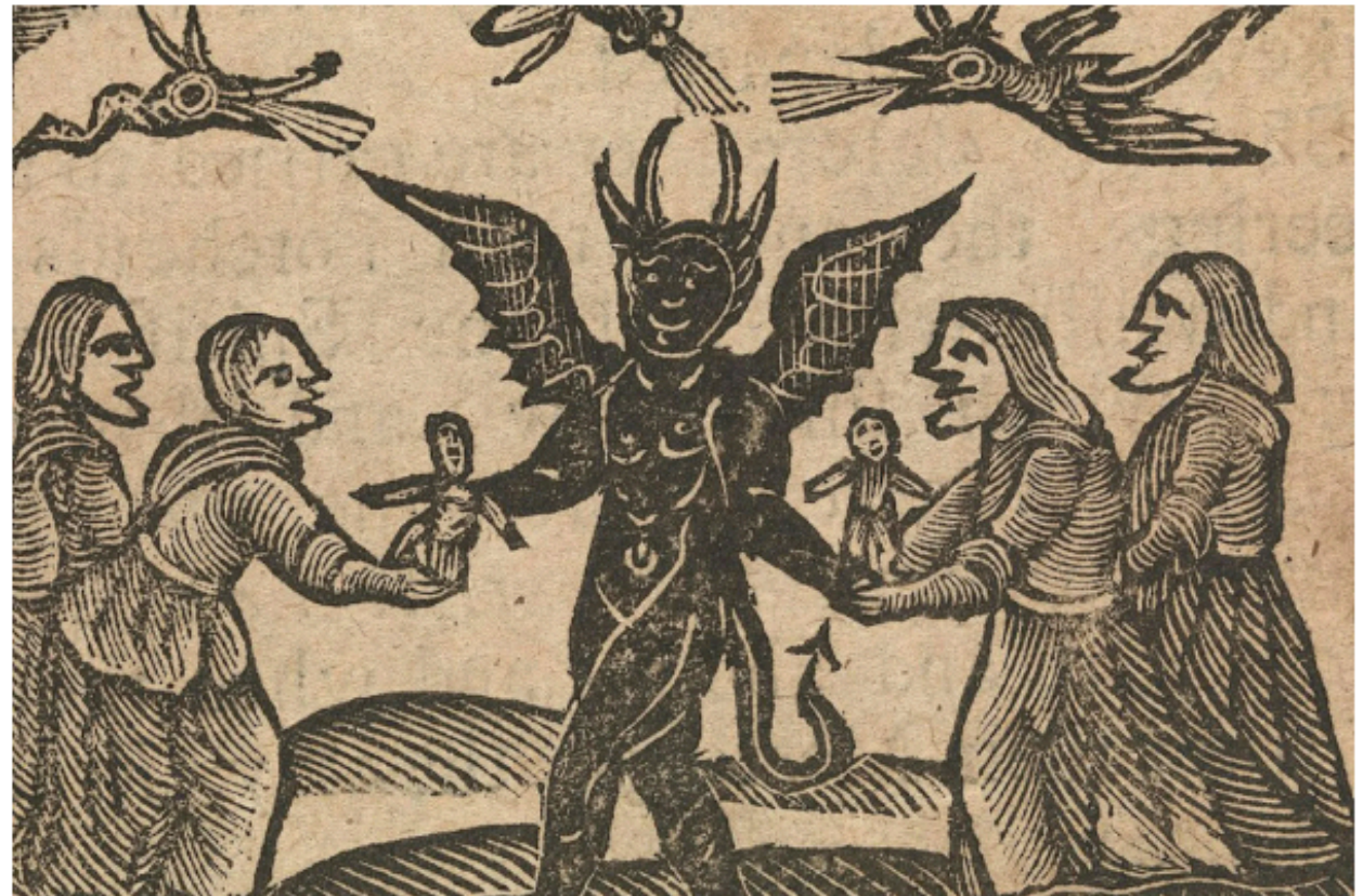
An illustration from “The History of Witches and Wizards,” published in 1720, depicting witches offering wax dolls to the devil.